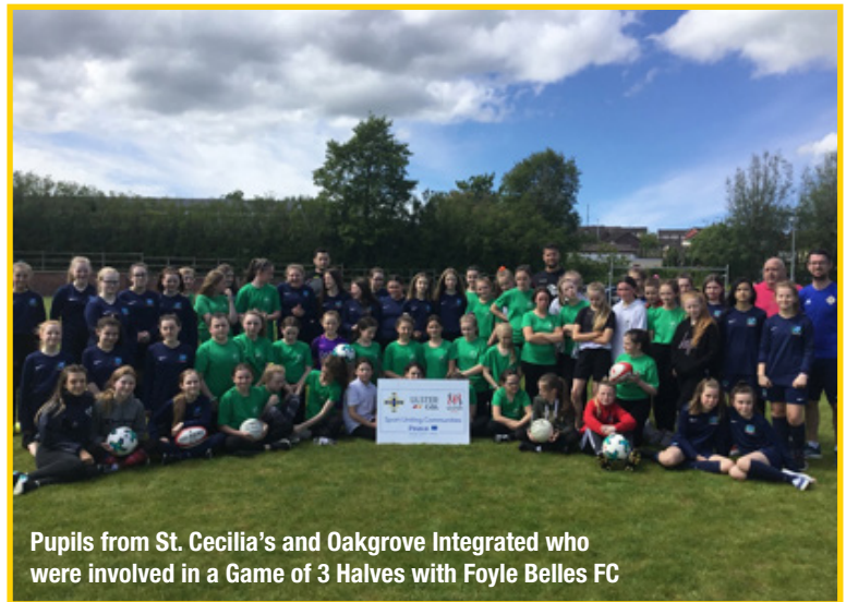
Pupils from St. Cecilia's and Oakgrove Integrated who were involved in a Game of 3 Halves with Foyle Belles FC

The purpose of these events is to bring people from different backgrounds together and offer them the opportunity to play sports they may not have had the opportunity to participate in previously. Participants are mixed with others from different backgrounds and receive coaching and matches in each sport. The sessions are designed not only to develop sport specific knowledge but also adopt, practice and endorse principles such as fair play, respect for other participants and inclusion.